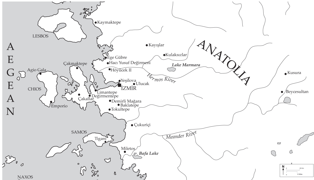
Figure 51.1. Map locating Yeşilova in Central-Western Anatolia.

various sizes, pieces of burned mud and pots belonging to the second level of the Chalcolithic period. Some whole pots and other finds were found in situ on top of this floor (Fig. 51.4).