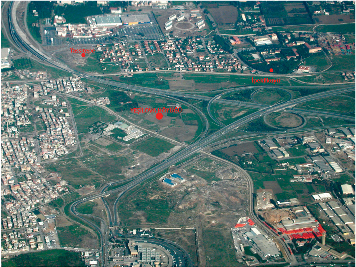
Figure 51.2. View of the Bornova Plain showing location of Yeşilova.

The ratio of open bowls is around 10% among the pottery of level III at Yeşilova. They vary in height, and their sides can be either convex or straight. Various types of handles and lugs are seen on them. On the interior of one group of bowls are symmetrical knob-shaped lugs. Analogues of such bowls are encountered at Liman Tepe VII and Orman Fidanlığı VII. 10