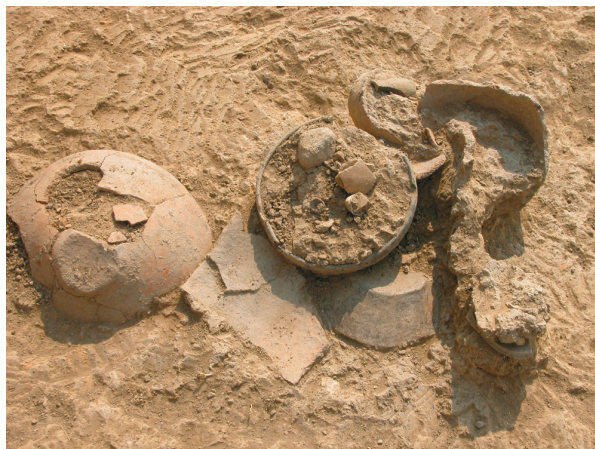
Figure 51.4. Chalcolithic vessels during excavation of level III.

The settlement of level III at Yeşilova reflects an advanced phase of the Middle Chalcolithic period. Gülpınar in North-Western Anatolia seems to belong to an earlier stage. Some parallels of the Yeşilova pottery found in the pottery of sites such as Kum Tepe IA form the basis of this inference. 13 Footed bowls are a characteristic example of this. The final phase of the process is observed at the settlement of Liman Tepe VII, where white-painted decoration characterises the ceramic assemblage. This decoration was applied to both carinated bowls with high handles 14 and newly-occurring bowls with inward-thickened rims. 15 There is a group of carinated bowls with high handles in the early layer of the Late Chalcolithic settlement at Bakla Tepe 4. 16 It is seen that this typical shape of the Middle Chalcolithic period disappeared, then bowls with inward-thickened rims, some of which had white-painted decoration, and their derivatives,