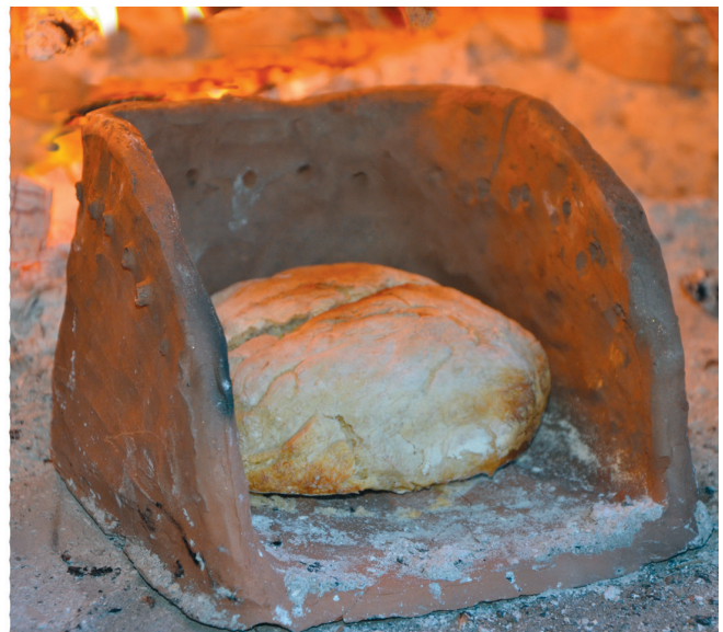
Figure 51.8. Fragments of a cheese pot (?) and suggested use in baking bread.