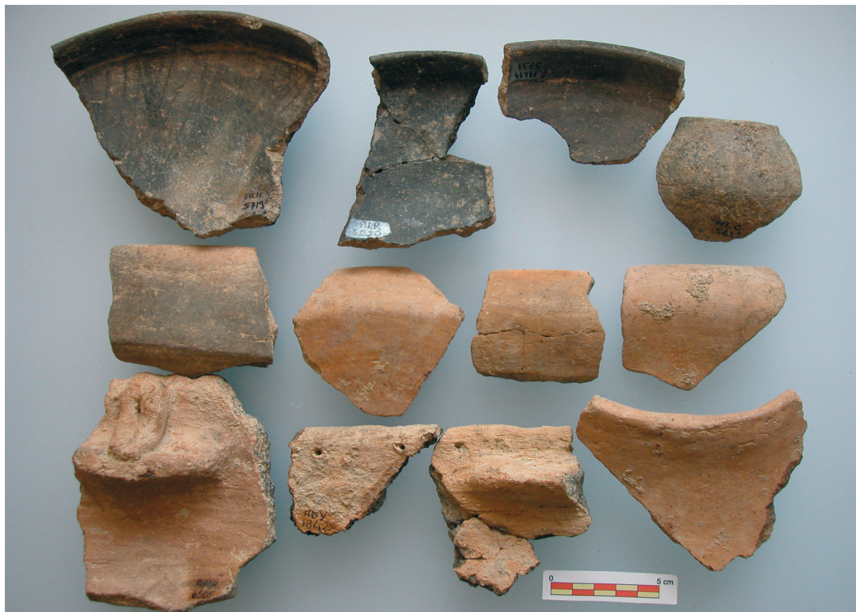
Figure 51.6. Chalcolithic pot sherds, level III.