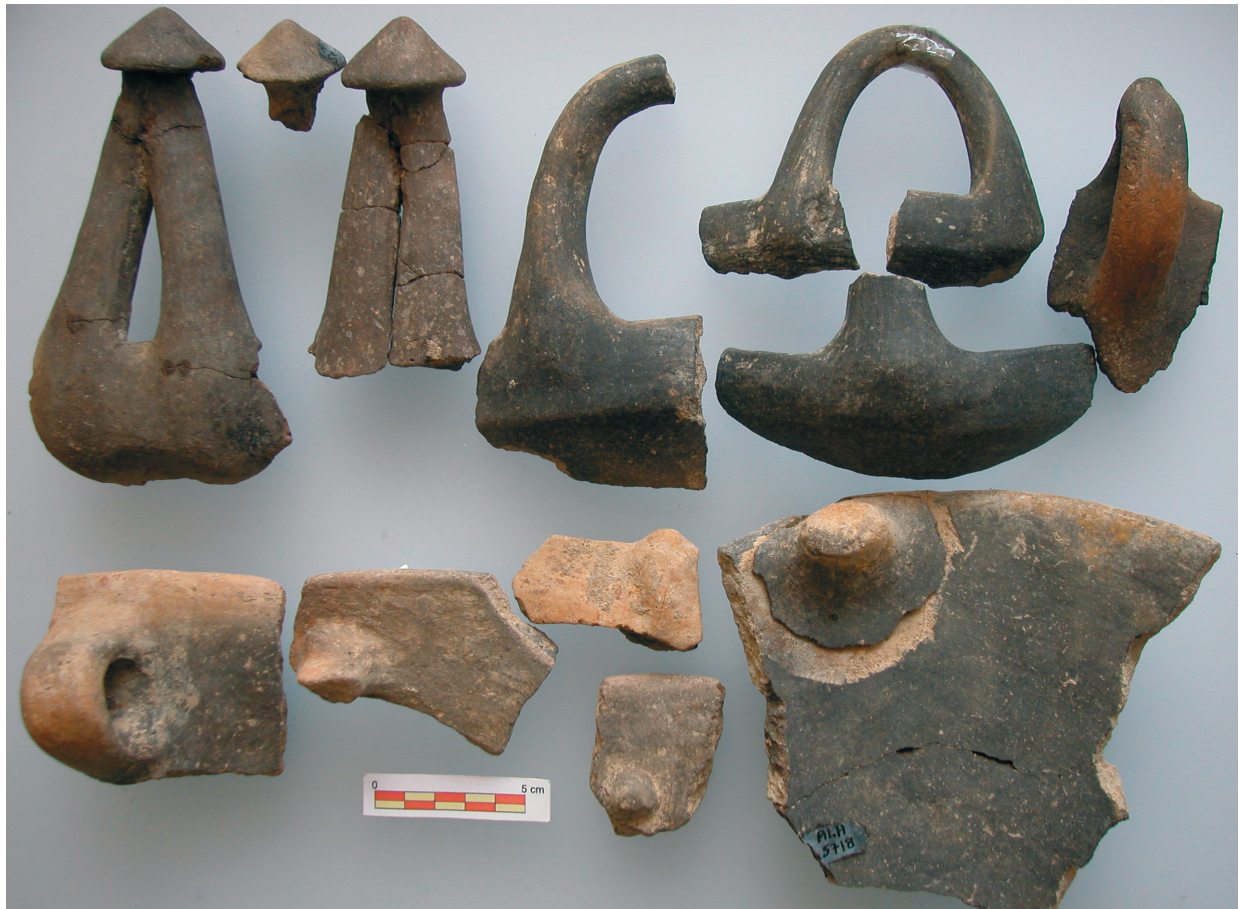
Figure 51.7. Chalcolithic pot sherds, level III.