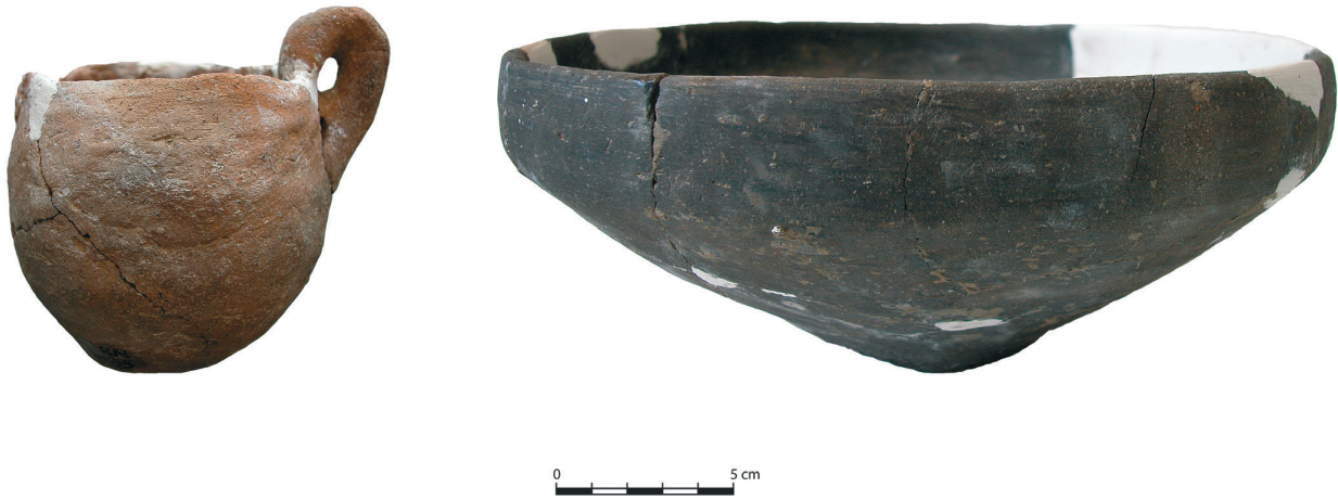
Figure 51.5. Complete Chalcolithic vessels, level III.